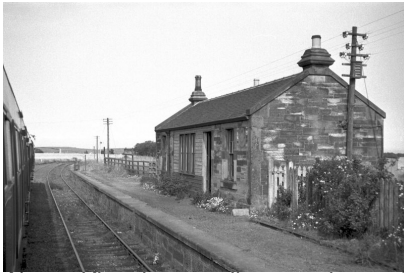
Above Kingsbarns railway station and waiting rooms before closure in 1930

principle crops grain and potatoes; the local stone freestone, ironstone, limestone and occasionally black marble.