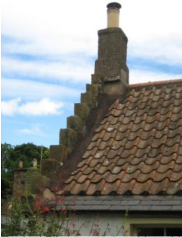
Typical Fife vernacular with corbie gables; slate easing course; pantiles and thackstone