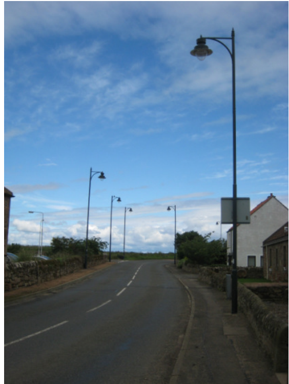
A total of 8 street lights within a single vista, looking NW along North Street. Note “heritage” lamps on oversized columns.

The selection of any “period” item off-the-peg should be based on archival documentation or other historical research. If no documentation or historic precedent exists, the next best option is to procure high quality street furniture to complement the architecture and character of the conservation area.