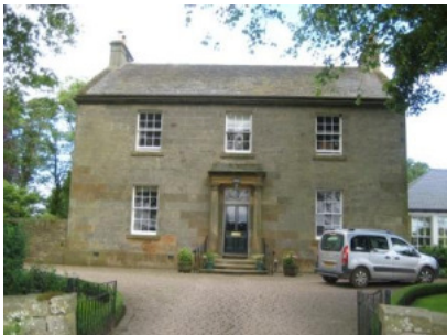
Former Parish Church Manse

Early 19 th century coaching inn. It is an important building in the history of the village and occupies a prominent position adjacent to the church on the main through road.