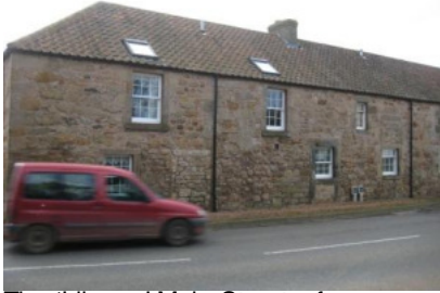
The 'Library' Main Street a former village hall and reading rooms following residential conversion (above). Photograph below shows elevation prior to conversion – note original pattern of windows and doors.