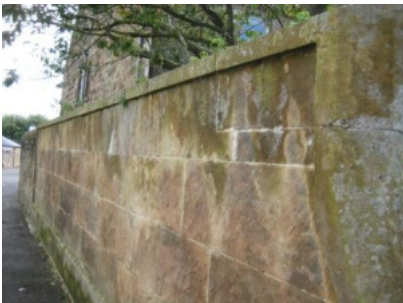
Kingsbarns House ashlar masonry