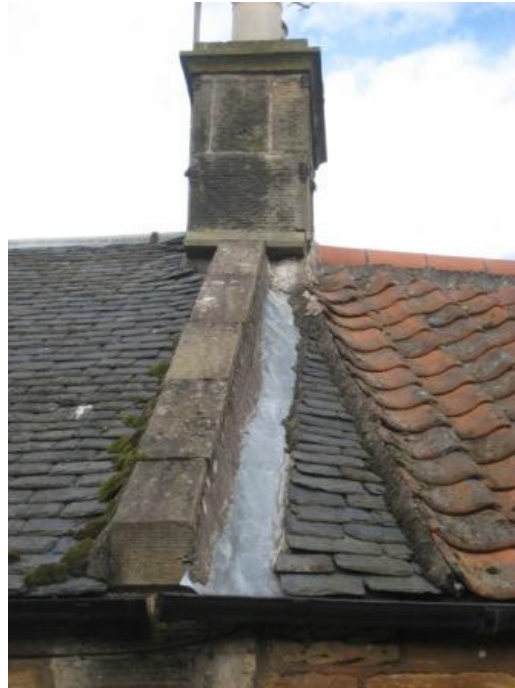
Use of slates at skew of originally thatched roof