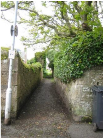
Private footpath between Bell's Wynd and Smiddy Burn – shown on 1854 OS map

this basic settlement pattern except the northern policy wall to Cambo House and parallel road leading to the former harbour. These formed a manmade boundary restraining the southward spread of the village. Plots and as a result frontages and building lines are distorted slightly from a strict grid pattern as a result of these features. The street pattern as shown on the Ordnance Survey 1 st Edition map has groups of buildings around each farm, with easy access to the farms and the surrounding countryside. The church, dating from the 17 th century, is located in the centre; and together with the village square and several significant historic buildings including the original school house, forms the heart of the village. An early 19 th century inn next to the church, fronts the A917 former turnpike road. Unusually and significantly, a large field shares a boundary with the main road and the village square. This brings the agricultural hinterland directly into the historic heart of the village and is a significant character feature.