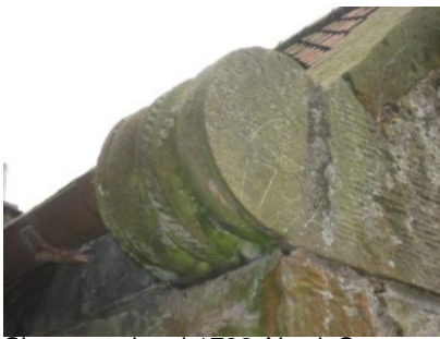
Skew put dated 1792, North Street