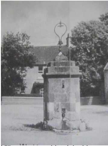
Village pump with original lamp

The historic quality of a conservation area can similarly be diminished by the casual use of ersatz “heritage” furniture from a catalogue.