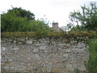
Parish marse rubble walled garden