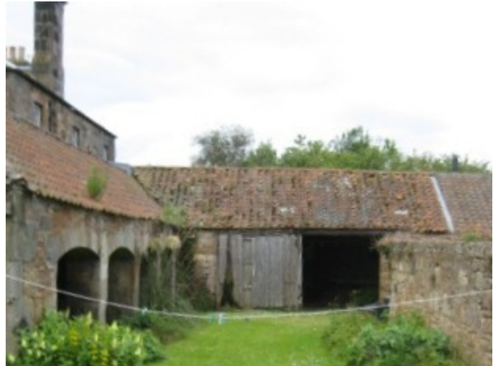
Early 19 th century Category C(S) listed former cart shed and barn at North Quarter farm

The former bakehouse at Torrie House is the last of these few remaining original, unrestored historic buildings. As such they are particularly important in colouring the historic character of the conservation area. Their destruction or any alterations which diminished their special character would be a major loss.