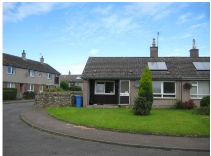
Multiple satellite dishes and solar panels on un-listed modern houses within the conservation area