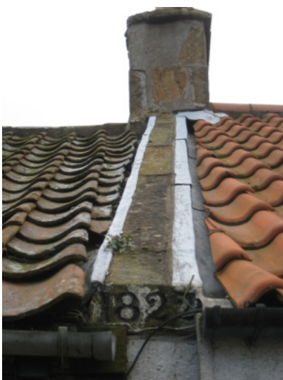
Use of 'secret' lead watertightening instead of a traditional lime mortar skew fillet.

A skew which was not at right angles to the roof ridge would not have caused any problem for a thatched roof but now requires tiles to be cut or a slate and tile mix skew detail to accommodate this.