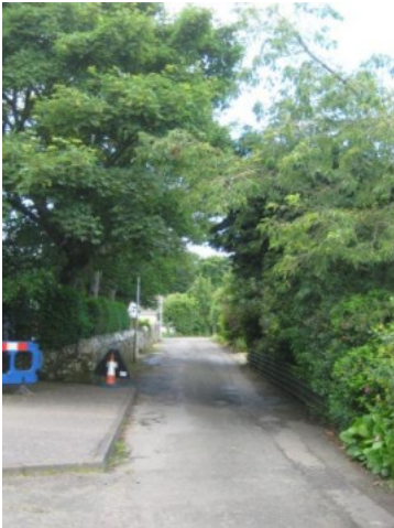
New private road at east end of Seagate serving modern development