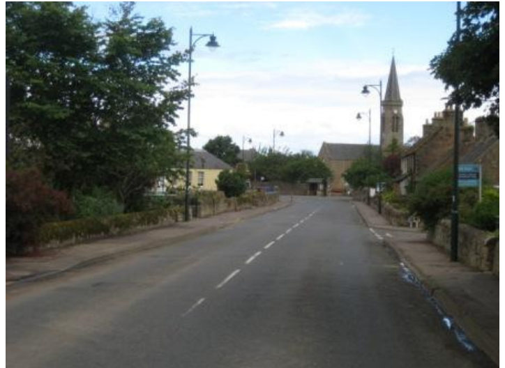
Main A918 through road looking north

There are no significant concentrations of activity within the conservation area which affect its character. Other than the A918 vehicular traffic movement is low and limited to residential access. There is some minor pedestrian movement within and between Bamyards and Kilconquhar and around the post office on North Street.