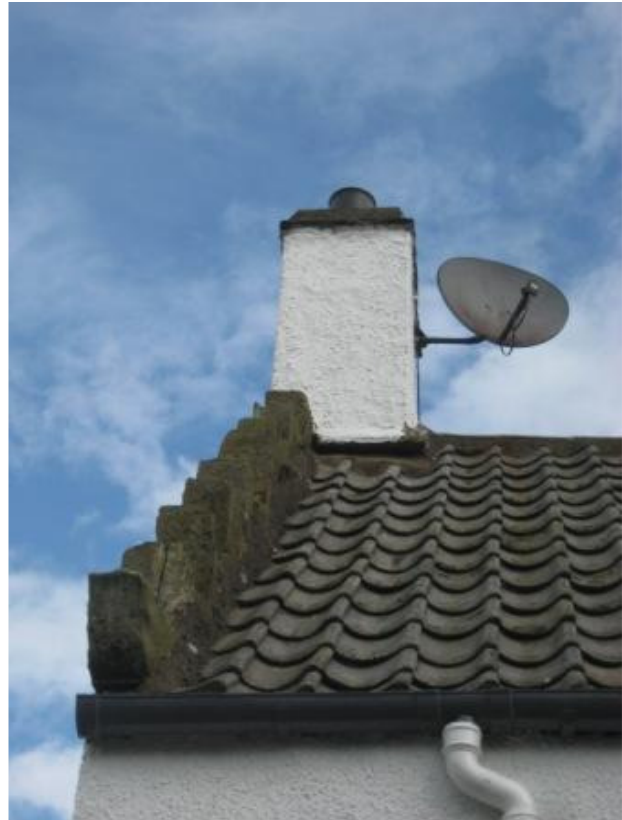
Satellite dish on a Category B listed house on Seagate

The introduction of a new architectural feature or addition to a listed building should be avoided if there is no historic precedent or evidence for it. A major extension or addition to a building, or the introduction of a new feature such as a dormer window may harm the special character of the building and the area. On a smaller scale, solar panels, satellite dishes and even TV aerials, which are clearly modern intrusions, diminish the historic character.