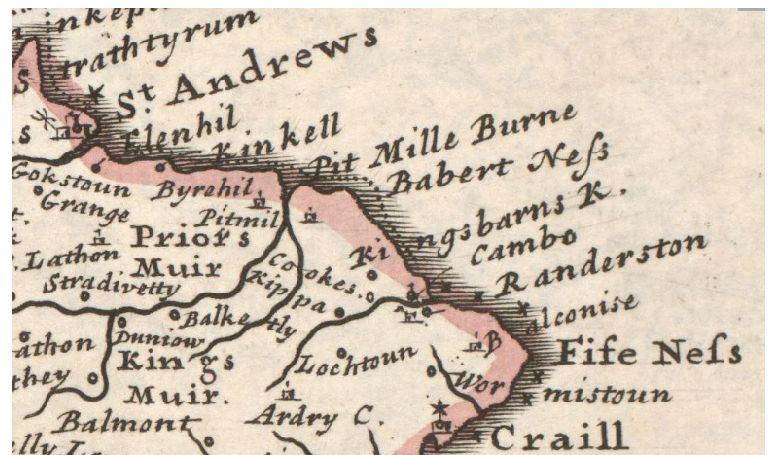
Extract from Herman Moll's County Maps of Scotland 1745. Note again 'Byrehil' (Kenly Green) House and 'Pitmil' House; also Cambo House. 'Pit Mille Burne' (Pitmilly), important as the location of several quarries and mills is also noted.

which survive post residential conversion today.