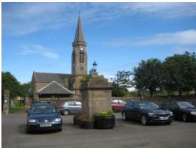
Above - village square and church graveyard; below- large field opposite with boundary walls and corner gate entrances.

The other main open spaces are the children's playground off Seagate and the graveyard around the church, both of which are maintained by Fife Council. Kingsbarns House has a large walled garden behind high rubble walls. Although mature trees are visible over the walls the general effect is to make the adjoining roads appear more closed in.