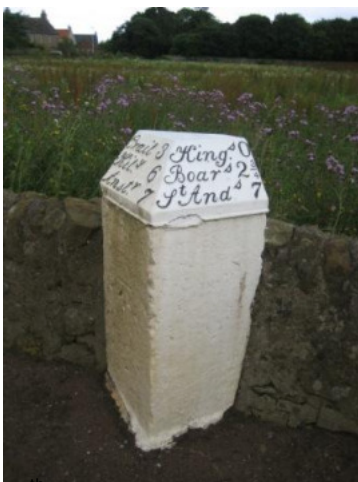
19 th century milestone on A917 former turnpike road