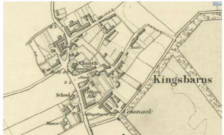
Extract from 1854 Ordnance Survey 1 st Edition

The topography of the conservation area is unremarkable, being level, with no water courses or any other natural features to influence the historic street pattern or character.