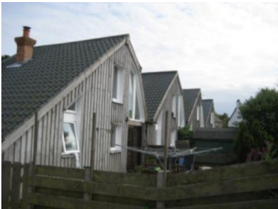
Concrete roof tiles and larch boarding