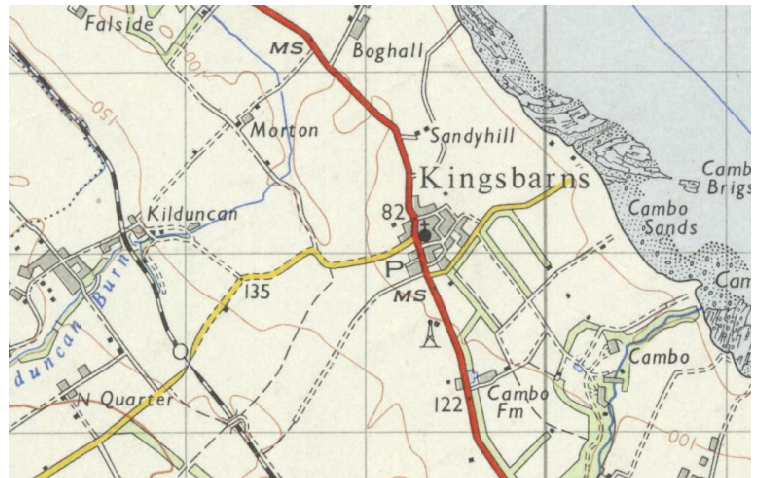
Ordnance Survey 1957. Note Kingsbarns railway station 1km to the SW of village.

Kingsbarns railway station was opened in 1883 and operated until 1930 when it closed as a passenger station. It continued on in use as late as the 1950s serving the village's three arable and dairy farms, transporting items such as cattle in to fatten and potatoes and sugar beet out to markets and processing. The line remained open for freight until 1965. Located 1 km to the west of the village, it contributed significantly to the continuing development of the village. The station was initially an intermediate station on the Anstruther and St Andrews Railway, used to transport farm animals and produce to markets such as Dundee or to the slaughterhouse and cattle market in Cupar. The station also provided access to the surrounding country estates for the shooting parties that were popular at the time. It was intended to be the end of the route of the East Fife Central Railway which extended from the Thornton/Methil main line through Kennoway, Montrave, Largoward to Lochty which was the terminus. The station was laid out with two lines to allow joining but in the event this did not take place.