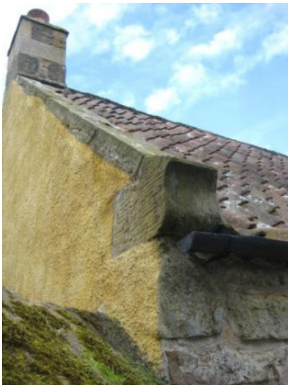
Woodside Cottage traditional lime harling and limewash.

Other examples of inappropriate modern materials used in the conservation area are plastic (PVC-u) soil and vent pipes, sometimes also protruding through the front roof slopes of listed buildings; plastic rainwater goods and concrete roof tiles.