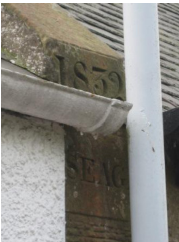
Dated skew put in Seagate

An unusually large number of houses and even the village pump have dated skew puts, lintels or other date stones. Almost half of these are 18 th century and the rest 19 th century, with dates ranging from 1732 to 1871.