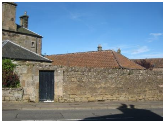
North Quarter steading rubble wall

A distinctive feature of the conservation area is the prevalence of stone boundary walls. Each former farm steading is still enclosed by substantial 2m high sandstone rubble masonry walls with imposing gate piers and throughout the village buildings have traditional rubble masonry boundary walls. There are few exceptions to this; these being mainly later additions or to modern developments.