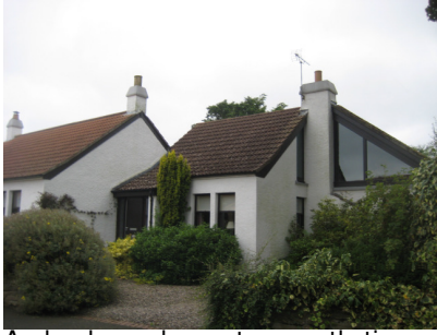
A clearly modern yet sympathetic addition to an unlisted mid-19 th century cottage in Lady Wynd

Within the conservation area, away from the main groups of listed buildings and especially within the groups of modern houses there have been many alterations and additions usually controlled through the Article 4 Direction. This is particularly evident at 30-38 Seagate, a row of early 19 th century cottages which although un-listed are typical of the conservation area and add much to its character. In addition to non-traditional replacement windows and doors No.38 has had windows completely changed and a flat roofed extension added, all united by modern cement white painted render. The combined effect not only destroys the unity of the row of cottages but introduces totally alien architectural elements to the conservation area.