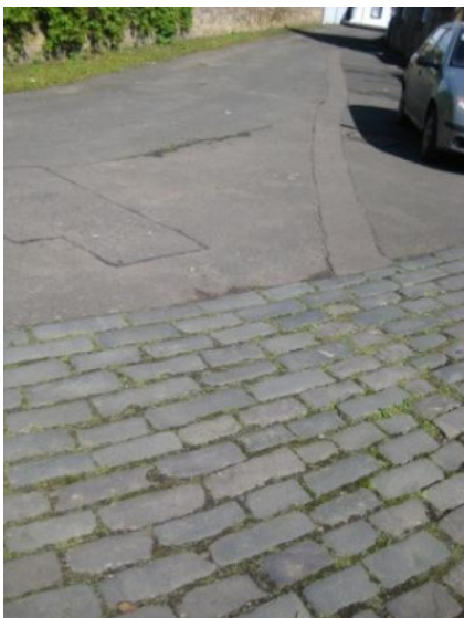
Traditional whin setts at the entrance to a former steading yard

Surface treatments should be sympathetic with the age of the majority of the listed buildings in the conservation area. Historically there may have been, if anything, cobbled or whinstone spalls or honored strips in front of buildings. Sett paving was expensive and used selectively for high wear areas. Early photographs show no raised pavements along Smiddy Burn but instead pavement wide strips falling to channels each side of the central roadway. Larger two storey houses are shown with paved areas immediately in front. Cottages have only rudimentary pavements.