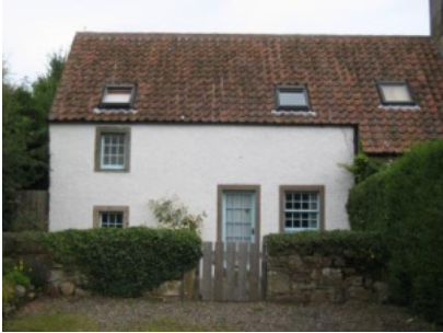
No.2 The Pleasance – fully glazed front door and roof lights; modern cement render and brilliant white masonry paint