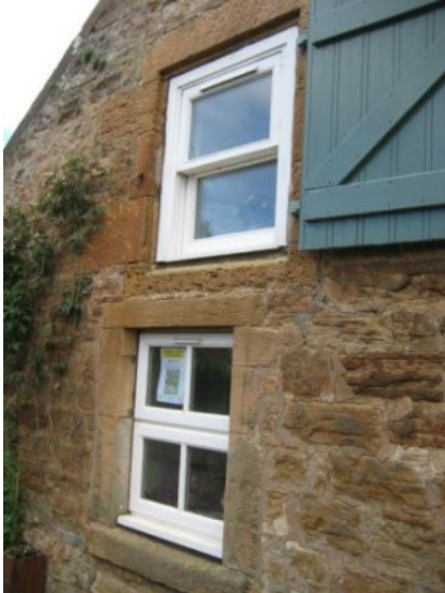
Uprvc windows on a Category B listed former croft at Bell's Wynd circa 1800

whenever possible to re-instate inappropriate windows and doors with well-designed traditional timber sash and case windows or solid panelled doors. The introduction of a new architectural element such as a dormer window or roof lights can have an adverse effect if the materials, design or scale is not appropriate. There are for this reason Fife Council design guidelines on replacement windows available online on www.fifedirect.org.uk .