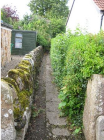
Private footpath between Lady Wynd and the Square – shown on 1854 OS map