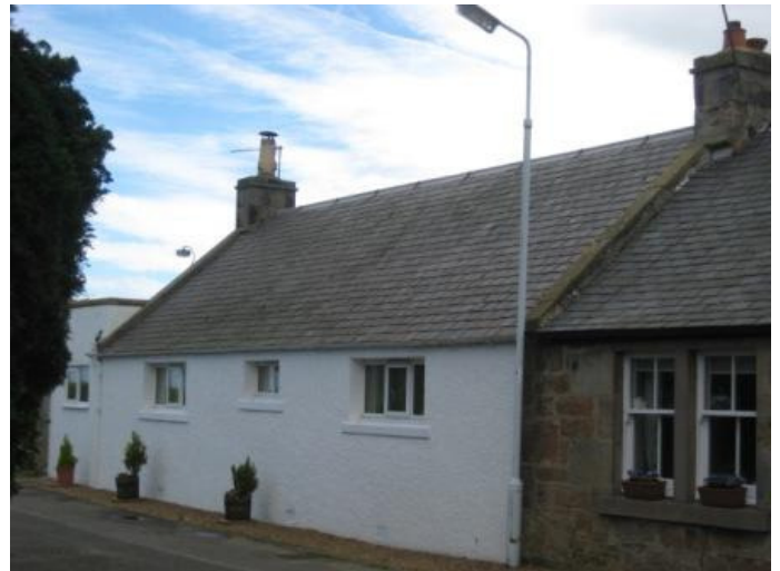
No.38 Seagate. Everything below eaves altered and a flat roofed extension added. Note unaltered cottage to right including skewput

Within the conservation area, away from the main groups of listed buildings and especially within the groups of modern houses there have been many alterations and additions usually controlled through the Article 4 Direction. This is particularly evident at 30-38 Seagate, a row of early 19 th century cottages which although un-listed are typical of the conservation area and add much to its character. In addition to non-traditional replacement windows and doors No.38 has had windows completely changed and a flat roofed extension added, all united by modern cement white painted render. The combined effect not only destroys the unity of the row of cottages but introduces totally alien architectural elements to the conservation area.