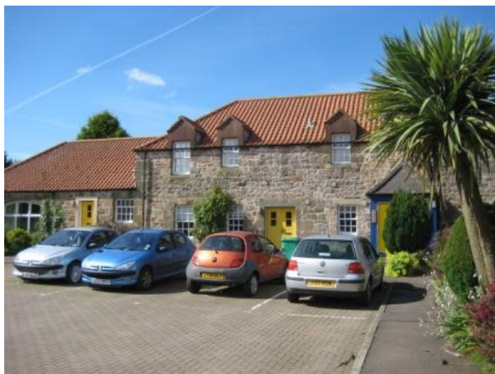
Domestic style windows, doors and porch, concrete paviors, palm tree and bright primary colours applied to 18 th century Category B listed farm steading.

The use of colour should be restrained as historically intense colours were not generally available. Care needs to be taken to avoid non-traditional colours which have no historic precedent and may detract from the special character of the area. Primary colours should be avoided for doors and for picking out margins although strong traditional colours in deep shades are acceptable for doors. The use of black for contrasting door and window margins is often considered traditional though there is no historic evidence.