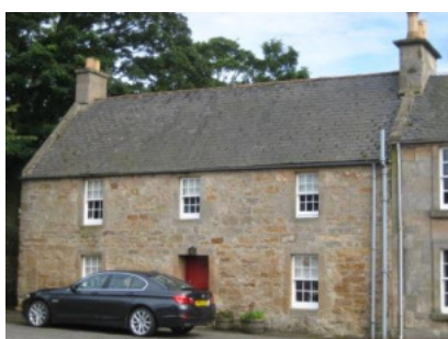
Cesneuk, The Square