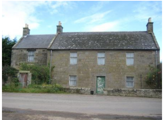
Category B listed 1786 former South Quarter farmhouse

The second is a collection of buildings; the remaining part of the Category C(S) listed early 19 th century North Quarter steading after the northern section was converted to residential use. This important remnant consists of largely unaltered, connected steading buildings including a threshing mill and cart sheds. These buildings represent the last remnants of the original farms which were highly significant in the history and development of the village.