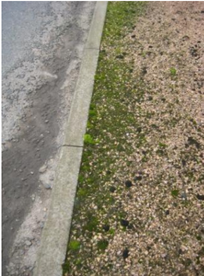
Pink stone chippings (and concrete kerb stones) used extensively throughout the conservation area

could be greatly enhanced by choosing designs and materials which are less urban and formal. Soft edges without gutters and kerbs (using set channels instead) would be appropriate in most areas. Cobbles and compacted stone chippings using locally sourced sandstone or whinstone would provide a more sympathetic historic setting for buildings than the pink stone currently extensively used. Although the pink felsite chippings from Balmullo quarry 14 miles away could be considered local it is probable that stone chippings sourced much closer would have been used. Most pavements within the conservation area are presently surfaced with compacted pink stone chippings with sandstone kerb stones. For roadways the most historically sympathetic surfacing would be hot-rolled asphalt with rolled-in chippings consistently sourced from a local quarry.