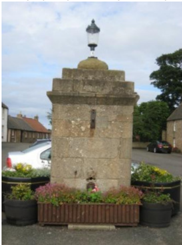
Village pump with replacement lamp

“...there are just as many Boroughs looking to maintain the traditional charm and character of their historic towns. The new ... fits that brief providing an authentic looking waste bin...”