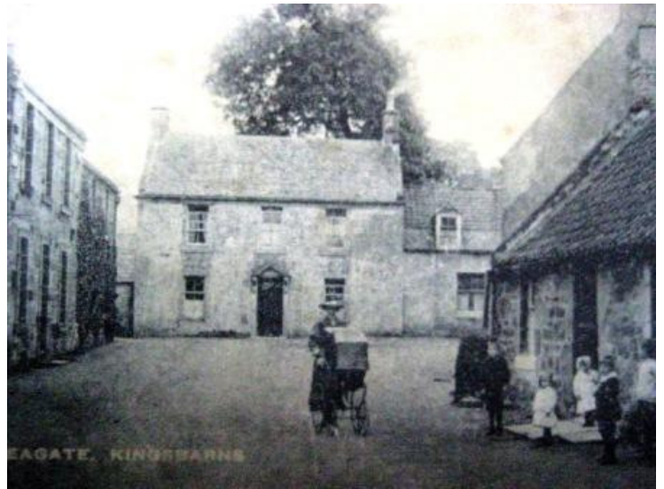
View looking west down Seagate towards Grey House circa 1900

enclosure. The population saw an initial drop in numbers before rising to its height following the further agricultural improvements in the early 19 th century. These improvements included greater specialism such as the growing of root crops in Fife. The population remained relatively stable over this period (1755 - pop. 871; 1801 - pop. 832; 1831-pop. 1023; and 1851 -pop. 893). However the population declined steeply post the two world wars, reflecting no doubt the wider major socio-economic changes. By 1951 the population had dropped to 511 and today it is approximately 400.