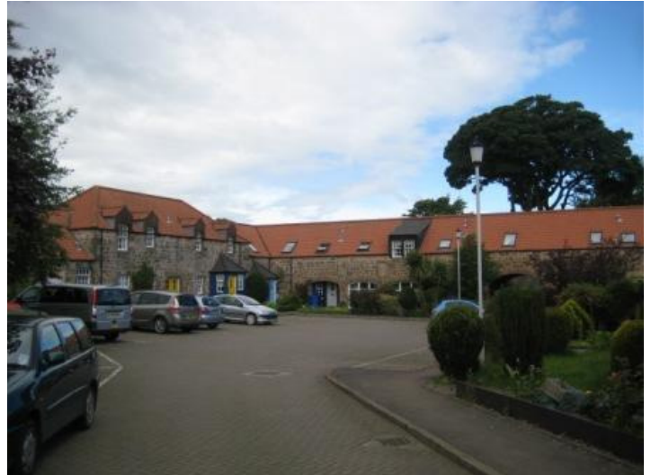
South Quarter Farm - residential steading conversion

Getting behind the appearance of a place is crucial to understanding and appreciating the linear patterns of development within a historic burgh, a planned neo-classical suburb or a 20th-century new town. Each place has its own character and its own story to tell."