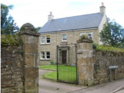
South Quarter farm steading and gate posts and walls

The dominant construction material for buildings and boundary walls is blonde sandstone, either as rubble or ashlar. Relatively few buildings are rendered, almost all with cement and painted with modern masonry paint. Woodside Cottage, Back Stile however is a good example of the recent use of the traditional lime harl and wash which would in the past have been commonplace.