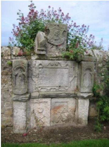
Sepulchral monument dated 1638 in graveyard

Archaeological evidence of past human activity in the area includes a 4,000 year old pot found at Pitmilly and recently (2003) a nationally important rare Pictish Class III Symbol Stone/ Christian cross slab from the 9 th or early 10 th century at Kilduncan. Two bronze age cists were discovered in 1873 at Kingsbarns Law. The first known reference to the parish of Kingsbarns or “Kingis-bemis” is a charter of 1519. The origin of the name Kingsbarns was in reference to the barns which supplied the royal palaces at Crail and Falkland. Although no such buildings survive, to the east of the village at the end of Sea Road are the remains of a harbour and nearby the possible remains of a ‘castle’ with secure store buildings. The harbour’s earliest record is from 1537 when it was used to collect taxes and Customs dues for the Burgh of Crail, the parish of Kingsbarns being until 1631 part of Crail.