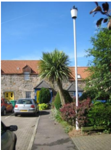
Residential steading conversion South Quarter Farm.

The second is a collection of buildings; the remaining part of the Category C(S) listed early 19 th century North Quarter steading after the northern section was converted to residential use. This important remnant consists of largely unaltered, connected steading buildings including a threshing mill and cart sheds. These buildings represent the last remnants of the original farms which were highly significant in the history and development of the village.