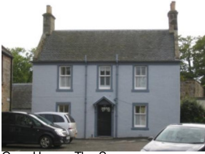
Grey House, The Square