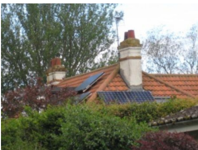
Solar panels and TV aerial

The introduction of a new architectural feature or addition to a listed building should be avoided if there is no historic precedent or evidence for it. A major extension or addition to a building, or the introduction of a new feature such as a dormer window may harm the special character of the building and the area. On a smaller scale, solar panels, satellite dishes and even TV aerials, which are clearly modern intrusions, diminish the historic character.