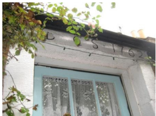
Dated window lintel in Lady Wynd