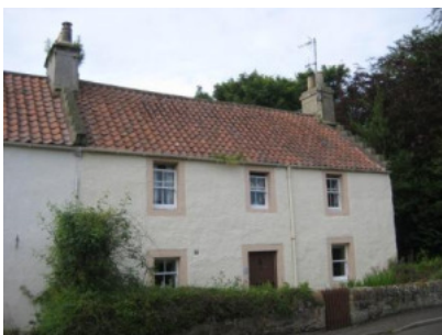
May Cottage, North Street

Fenestration is generally symmetrical. The earlier 18 th century buildings usually having a higher wall surface to opening (mass to void) ratio than later 19 th century buildings.