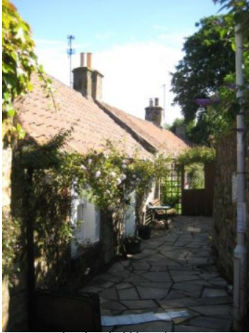
4, 6 and 8 Lady Wynd