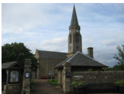
Kingsbarns Parish Church

There are 55 statutory list entries for the conservation area. A high proportion of these (67%) are Category B listed. The remainder are Category C listed. In some cases the listing relates to a number of buildings. In addition to buildings the entries cover items such as the drinking fountain in the square and a sepulchral monument in the graveyard. Appendix 2 of this appraisal provides descriptions and photographs of all listed buildings and structures in the conservation area all of which are of historic or architectural importance. The following are identified as particularly significant: