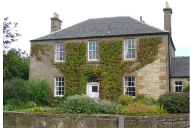
North Quarter House, Main Street