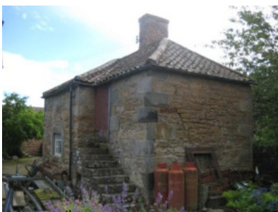
Early 19 th century Category B listed former bakehouse at Torrie House

The 1786 dated, Category B listed, South Quarter farmhouse appears vacant and in poor condition although still in a farming related use. The building is particularly significant as a last reminder of the farms which were so important in the development