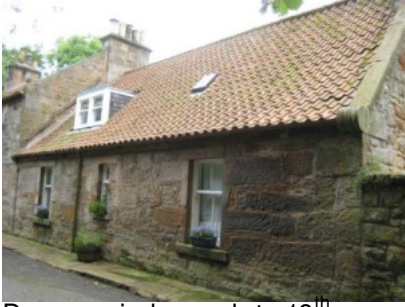
Dormer window on late 18 th century cottage